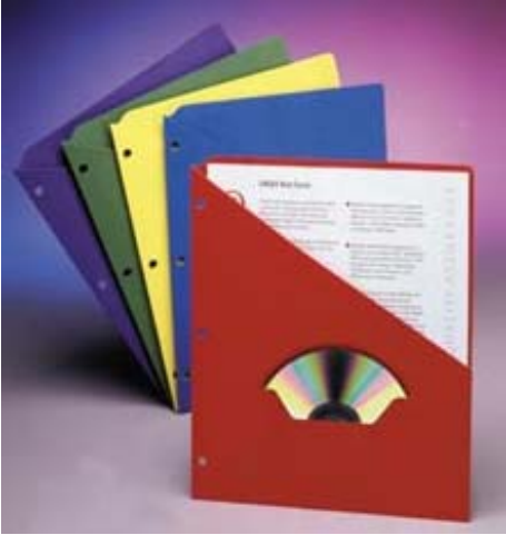
Three-Hole Punched Slash Pocket Project Folders