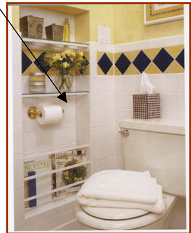
Faux Leather Boxes