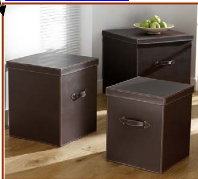
Faux Leather Boxes